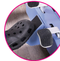
Foot 'push pad' helps reduce the force needed to initiate forward movement.