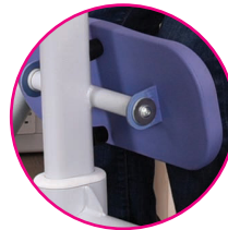
Soft moulded knee pad for comfort