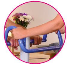
Contoured, multi-point push handle and patient hand-hold bar