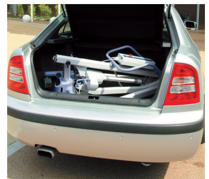
Fits neatly in the boot of an average family sedan car.