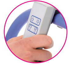
Hand control clip ensures convenient storage when not in use.