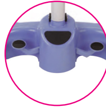
Foot 'push pad' helps reduce the force needed to initiate forward movement.

This view is shared by our clinical consultant team, who have assisted us in conducting detailed usability surveys to ensure the Advance meets the true needs of the patient, carer and the environment in which it operates.