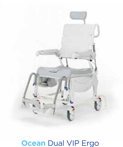
An advanced tilt-in-space chair with -5° to 40° tilt and additional backrest recline.