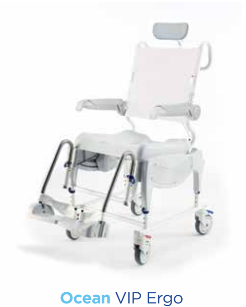
An advanced tilt-in-space chair with -5° to 40° tilt.

Meet our most advanced tilt-in-space shower chairs with the latest design enhancements. Highly configurable and modular, the Ocean VIP Ergo and Ocean Dual VIP Ergo offer bathing and showering solutions with increased levels of comfort and support.