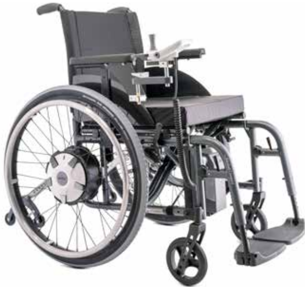
e-fix E36: powerful drive wheels with more power (optional)