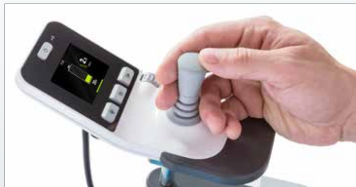
Informative colour display and user-friendly control elements