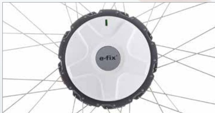
Compact, light, powerful: the e-fix drive unit