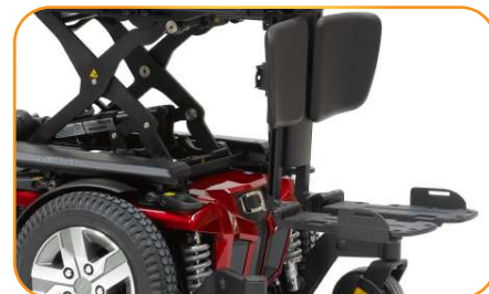
Swingaway legrests with angle adjustable foot plates or centre-mount footboard