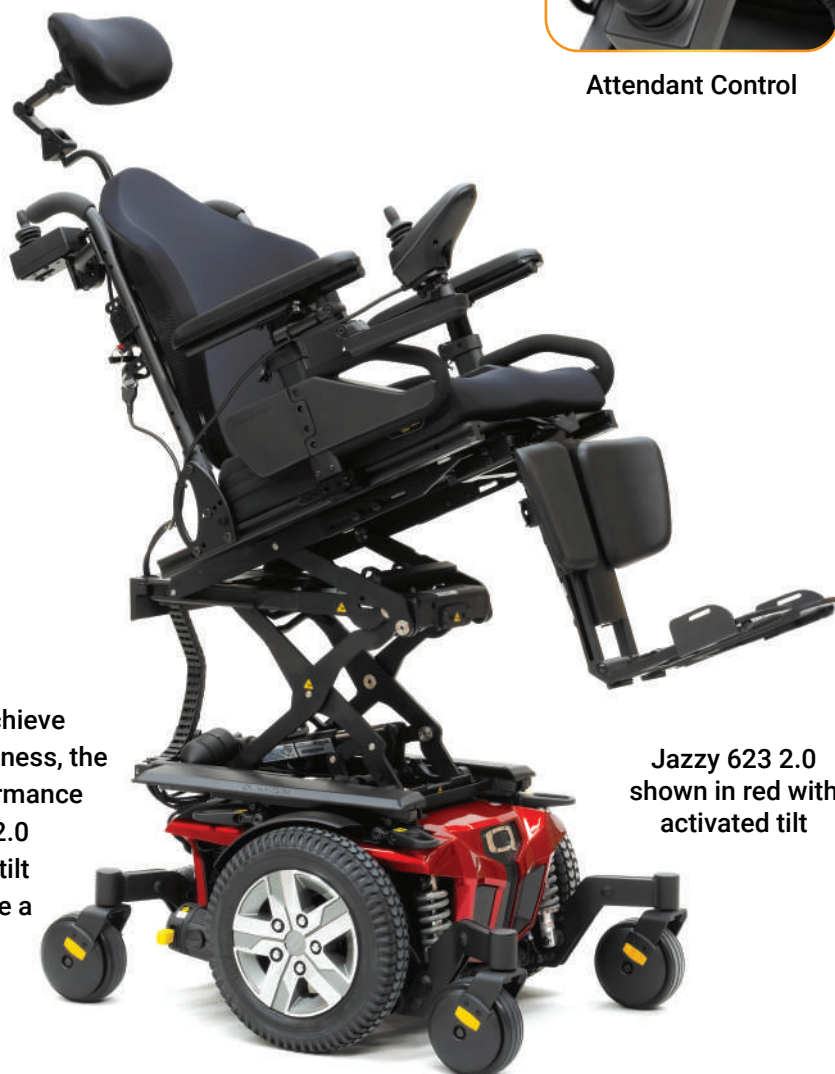
Jazzy 623 2.0 shown in red with activated tilt