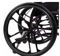
Sporty rear wheels