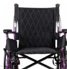
Modern frame colours and upholstery