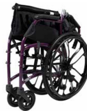
Folds for easy transport and storage

Upholstery Black | Purple Frame Shiny Purple MWS449868