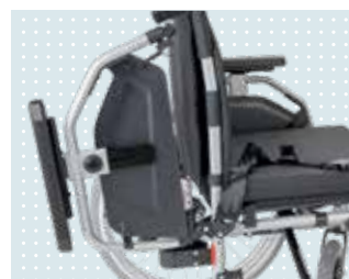
Swing-away side panel