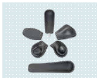
Arm and hand support