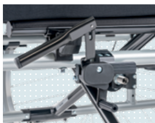
Wheel lock lever extension