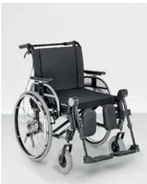
• Start M4 XXL – The model for special sizes Lightweight segment