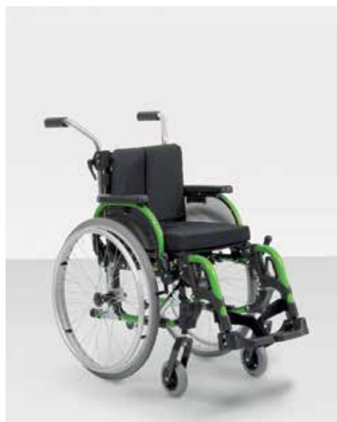
• Start M6 Junior – The model for kids Lightweight segment