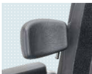
Lateral thoracic support