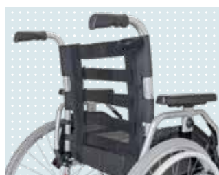
Economy Ergo back support upholstery