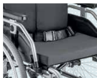
Lap belt with closure