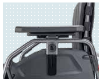
Height-adjustable forearm support