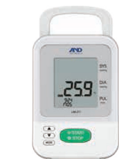
Stand-by display (Room temperature)