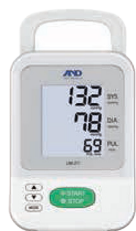
Measurement display (with backlight)