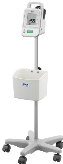
In combination with optional mobile stand