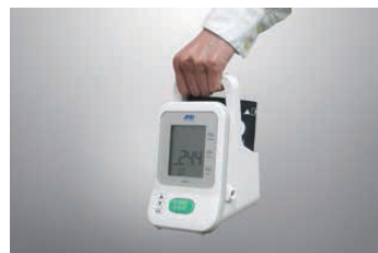
Easy to carry