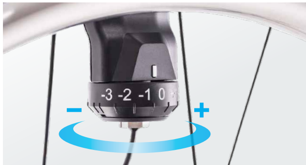
Adjustable sensitivity of the drive sensor in seven steps