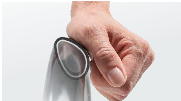
Optional coated pushrim with ergonomic shape for users with limited hand or triceps function (e.g. Quadriplegics)