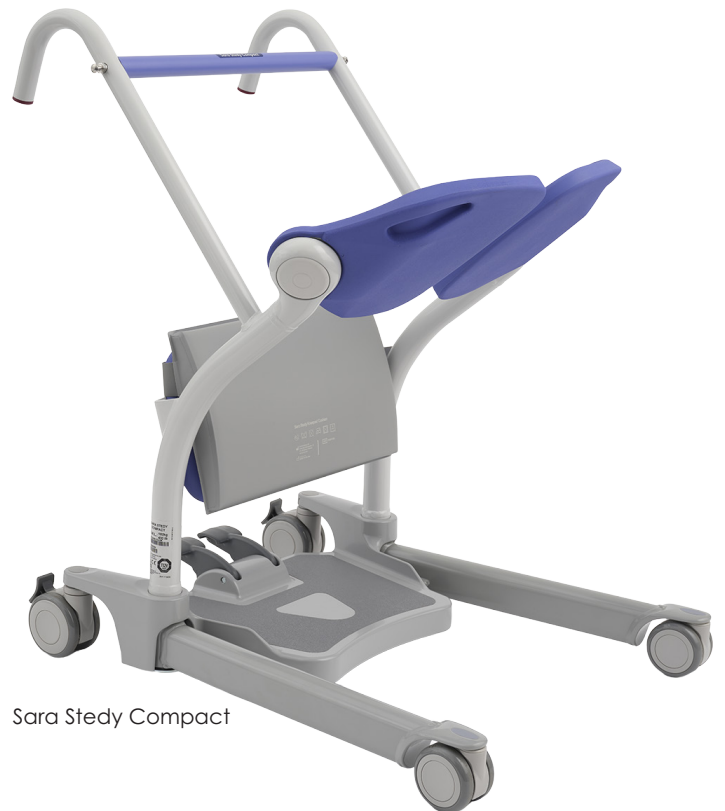
Sara Stedy Compact